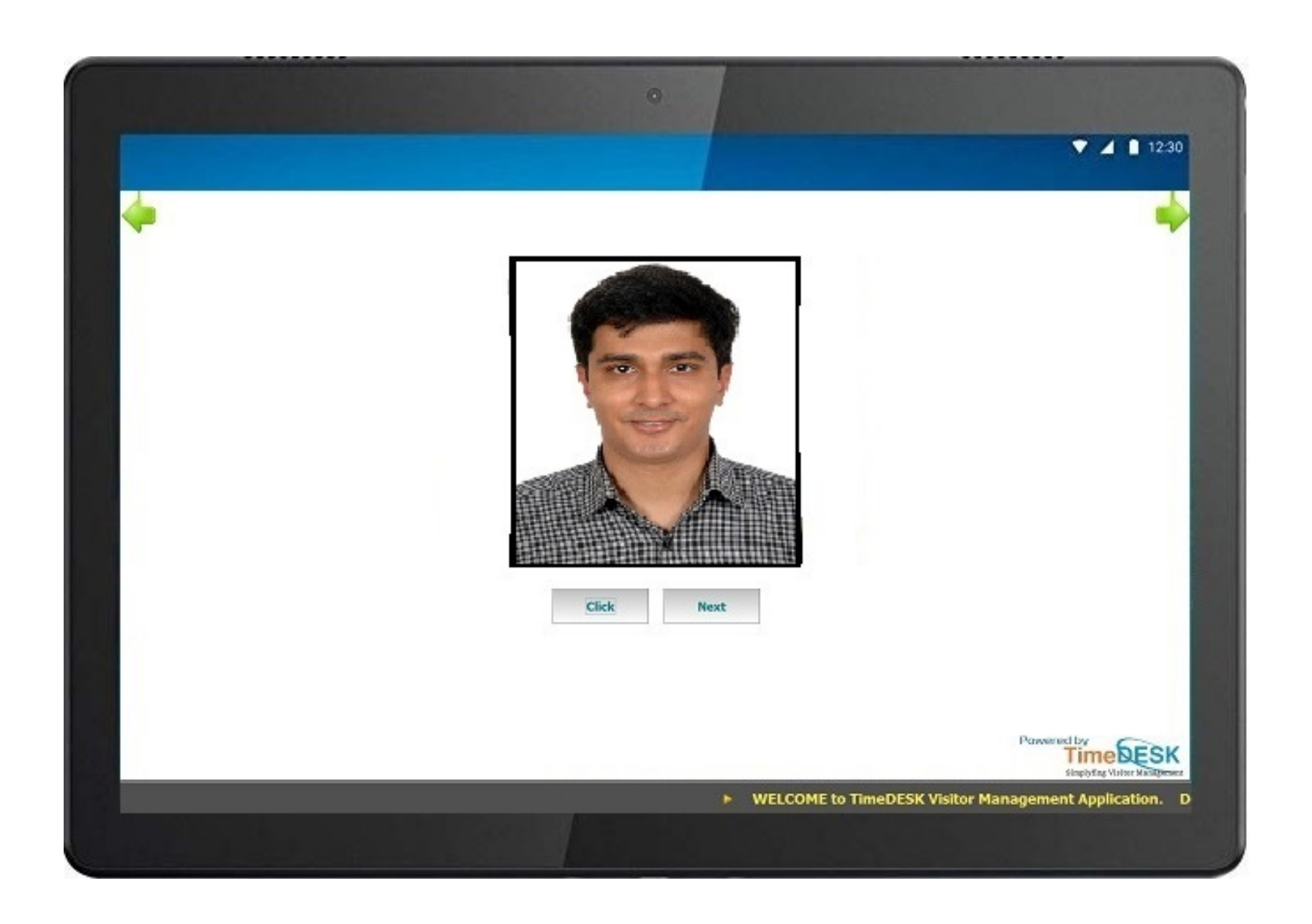
Snap (Photograph) of the visitor need to be taken